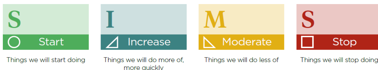
Figure 1: SIMS Framework

Savills IM have collaborated with Hillbreak Ltd to develop an integrated sustainability governance framework, which guides our activities to our long-term vision to be respected for our expertise in resilient real estate investment. Developed by Hillbreak Ltd, the bespoke SIMS framework translates our sustainable ambitions into procedural realities and ensures a consistent approach across Savills Investment Management, see Figure 2 below. It itemises those behaviours and activities that need to be altered as we shift the focus of our business in the pursuit of sustainable outcomes by classifying what we need to start, do more or less of and, where inconsistent with our RI ambitions, to stop. It also indicates the timeframes for doing so. Further details on SIMS and how we starting to apply it can be found here .