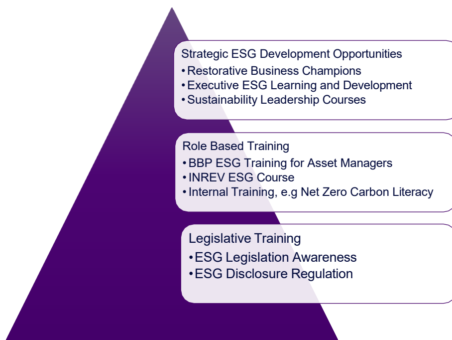
Figure 2: Savills IM ESG L&D Pyramid